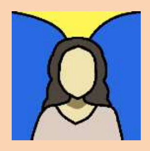
By Alpha's editor and channel

What a fearsome thought! No, you are not going to hell, and there is no hell - unless you redefine hell as some kind of temporary unpleasant after-life of your own making, from which you can escape. Even if this mild version of hell exists, you might not go there even if you think you are a bad person. Let's look at all the issues.